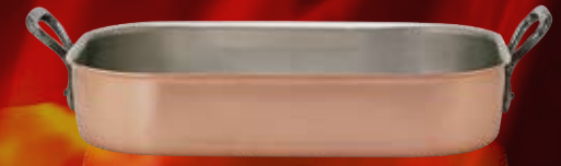
Roast tray rect.