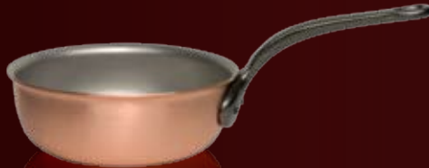
Sauté pan spherical